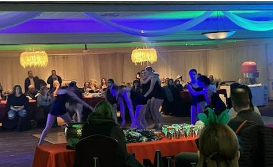
Dancing inside Venue to Thriller